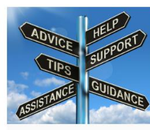
FosterWiki Toolkit for Top Ten Tips