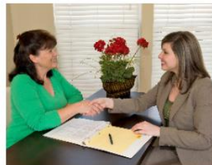
FosterWiki Toolkit for New Social Workers