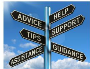
FosterWiki Toolkit for Top Ten Tips