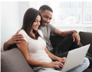
FosterWiki New Foster Carers Toolkit