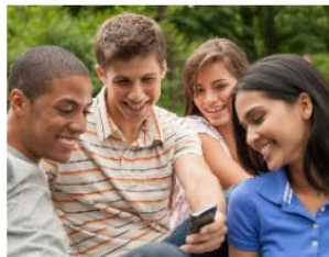
FosterWiki Fostering Teenagers Toolkit